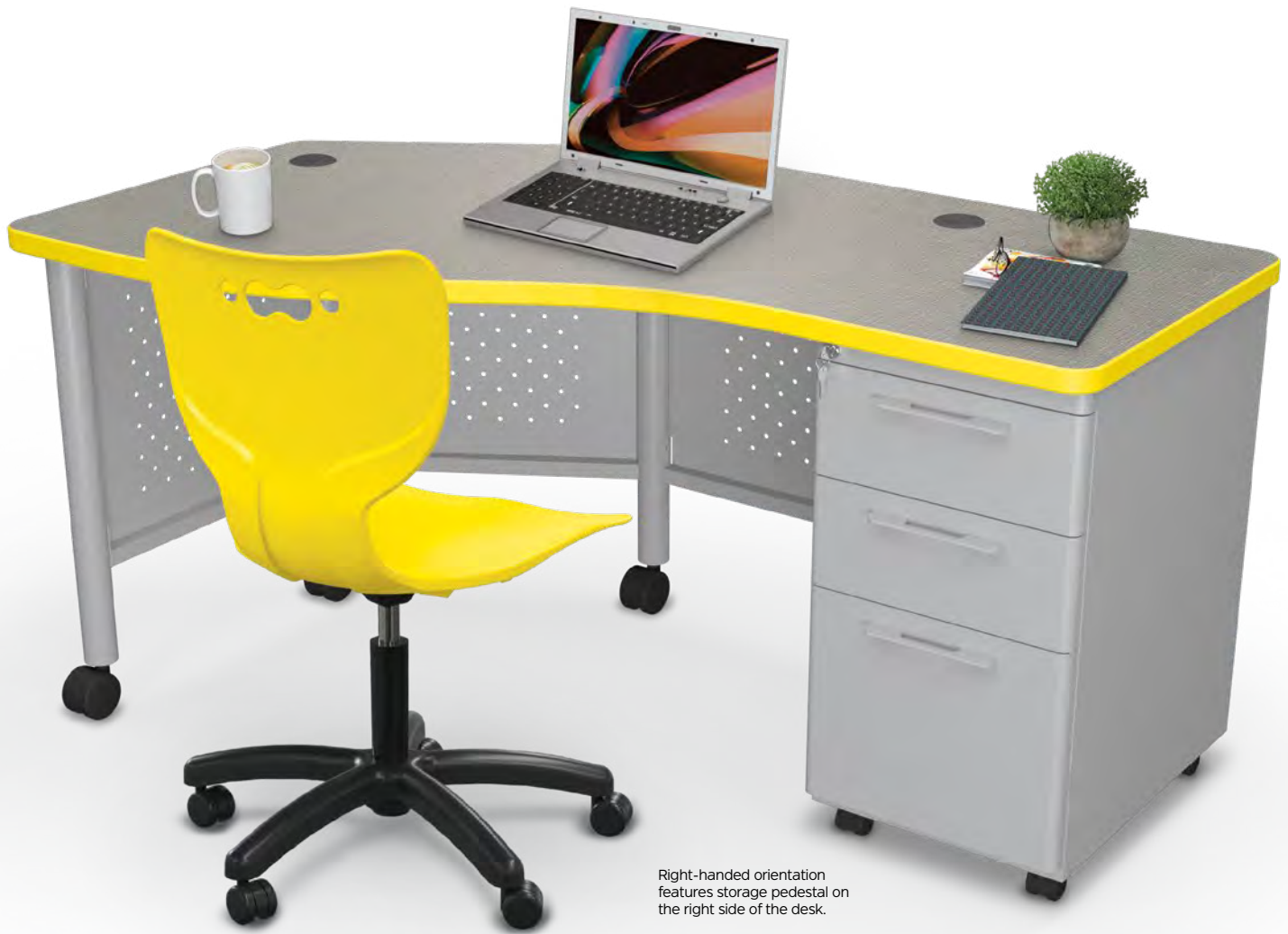
Right-handed orientation features storage pedestal on the right side of the desk.