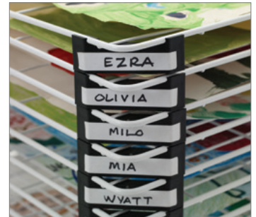
Personalized rack spacers