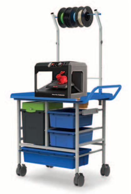
NEW 3D Printer Cart - Base Model with Tub Pack 2 (TD5003)