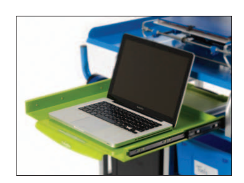
Premium models have a slide-out laptop tray