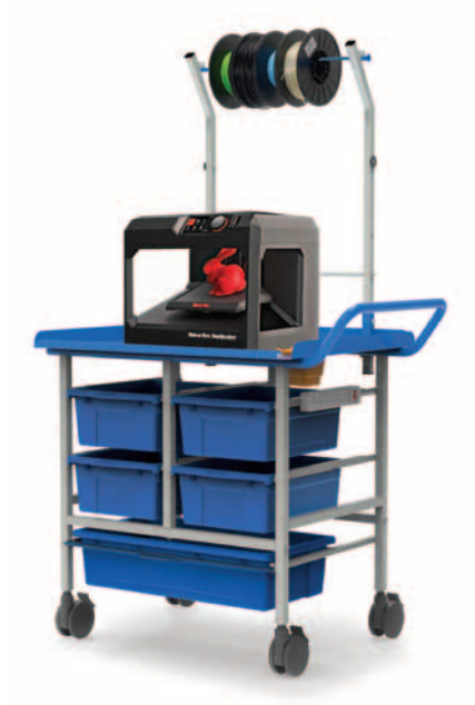
NEW 3D Printer Cart - Base Model with Tub Pack 1 (TD5002)