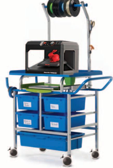
3D Printer Cart - Premium Model with Tub Pack 1 (TD5000)