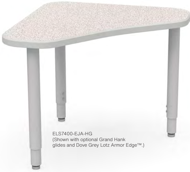
ELS7400-EJA-HG (Shown with optional Grand Hank glides and Dove Grey Lotz Armor Edge™.)