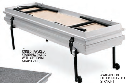
JOINED TAPERED STANDING RISERS WITH OPTIONAL GUARD RAILS

Straight and Tapered units cannot be combined. Straight units can only be ganged with straight units; Tapered units can only be ganged with tapered units.