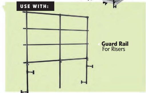
Guard Rail For Risers

NOW AVAILABLE: 4 th Level Add-On FOR THE Trans-Port Riser MODEL #TPA