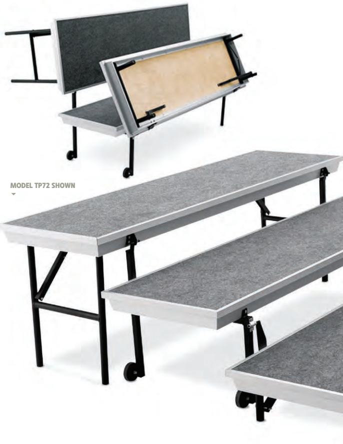
MODEL TP72 SHOWN