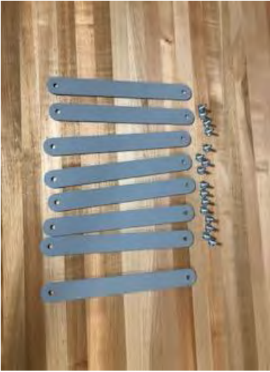
Assembly Kit comes with 8 brace Plates