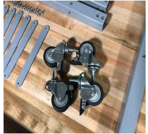
4 Threaded Casters