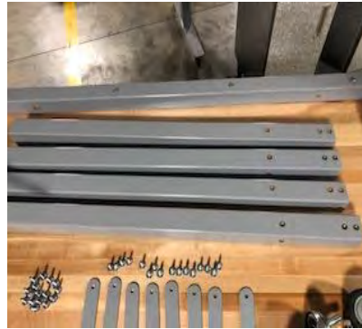
4 Legs, 32 Screws ¼-20 x 20mm serrated