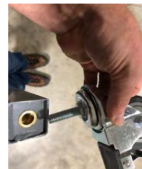
Step 5: Attach threaded caster to leg insert. Tighten with ¾" wrench. Continue until all 4 casters are tight.