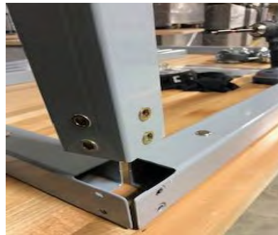
Step 2: Take leg as shown and turn so inserts align with holes in frame. Use the ¼-20 x 20mm serrated screws to bolt leg to frame. Continue on each corner until all four legs are attached to frame.