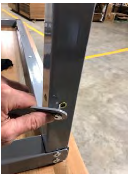
Step 4: Attach brace plate to leg and frame using ¼-20 x 20mm serrated bolts. 2 plates per leg, 8 total.