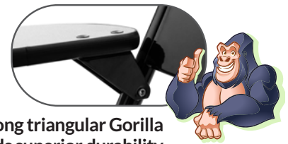
Ultra-strong triangular Gorilla bracket adds superior durability