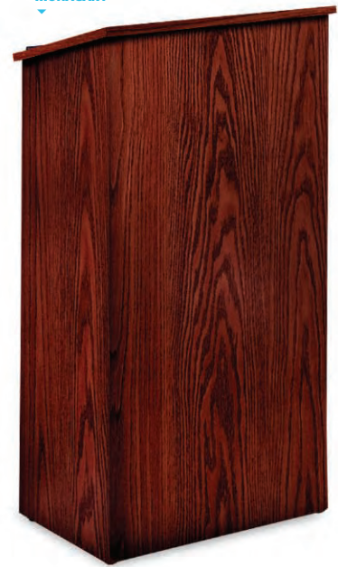
SHOWN IN MAHOGANY