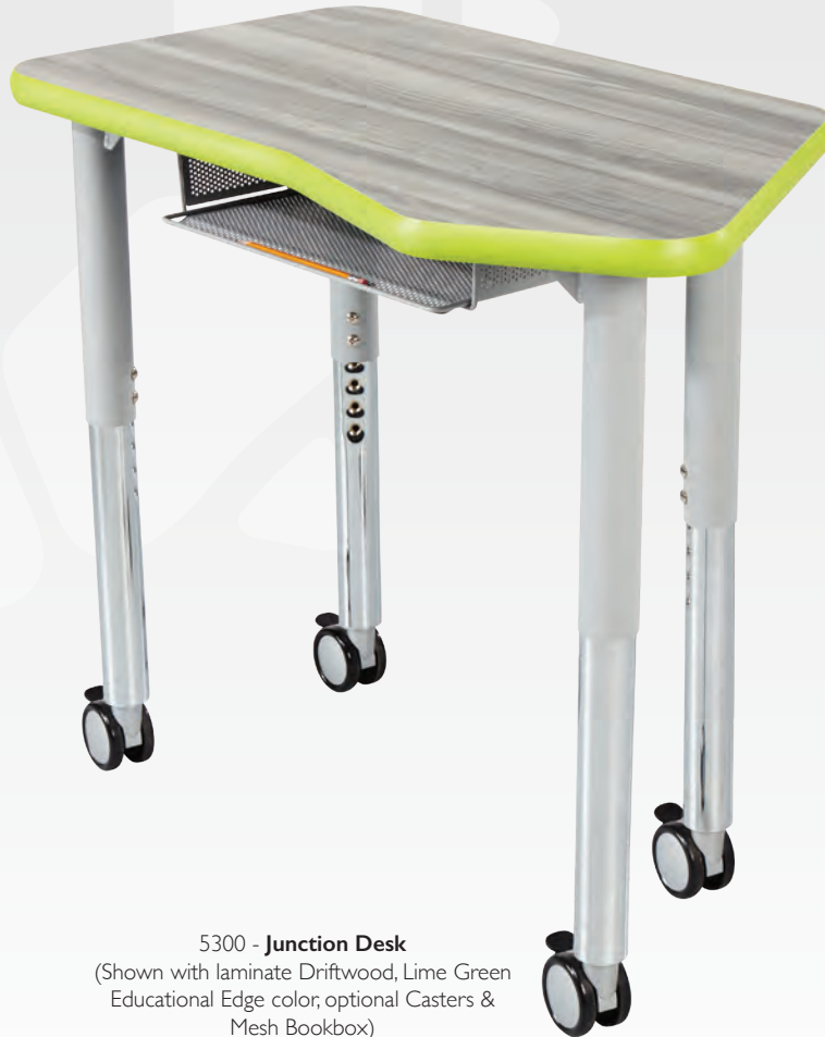
5300 - Junction Desk (Shown with laminate Driftwood, Lime Green Educational Edge color, optional Casters & Mesh Bookbox)