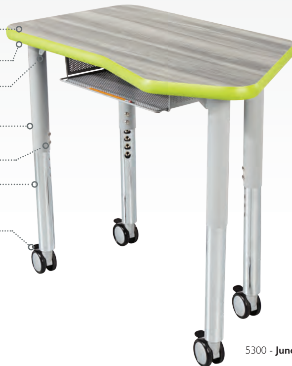
5300 - Junction Desk