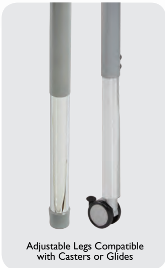
Adjustable Legs Compatible with Casters or Glides