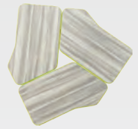
Pod of 3