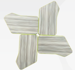
Pod of 4