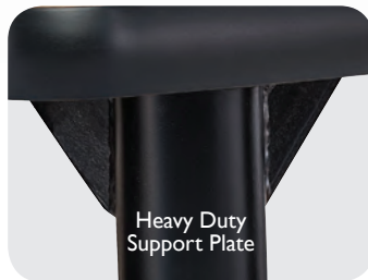
Heavy Duty Support Plate