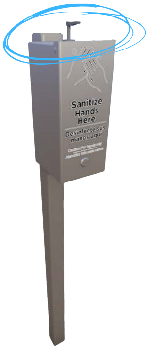
33 oz Hand Pump Model (P1008 & P1009)

Hand Sanitizing has never been easier with UltraSite's Hand Sanitizer Stations! These units are designed to withstand the outdoor elements, feature signage in both English and Spanish and come with your choice of hand pump or touch free automated dispenser. They are available as inground, surface mounted, or portable (portable plate sold separately).