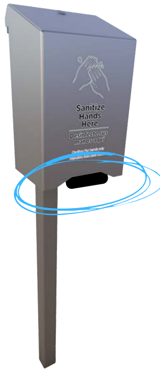
1000 oz Hand Pump Model (P1014 & P1015)