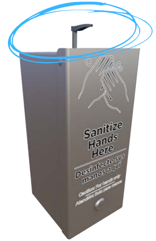
P1010 Sanitizer Add On