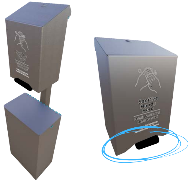
P1015S Sanitizer w/ Receptacle