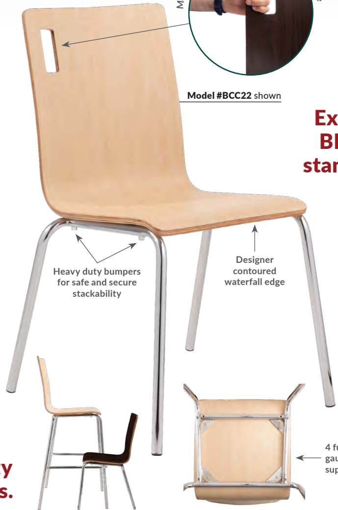
Model #BCC22 shown