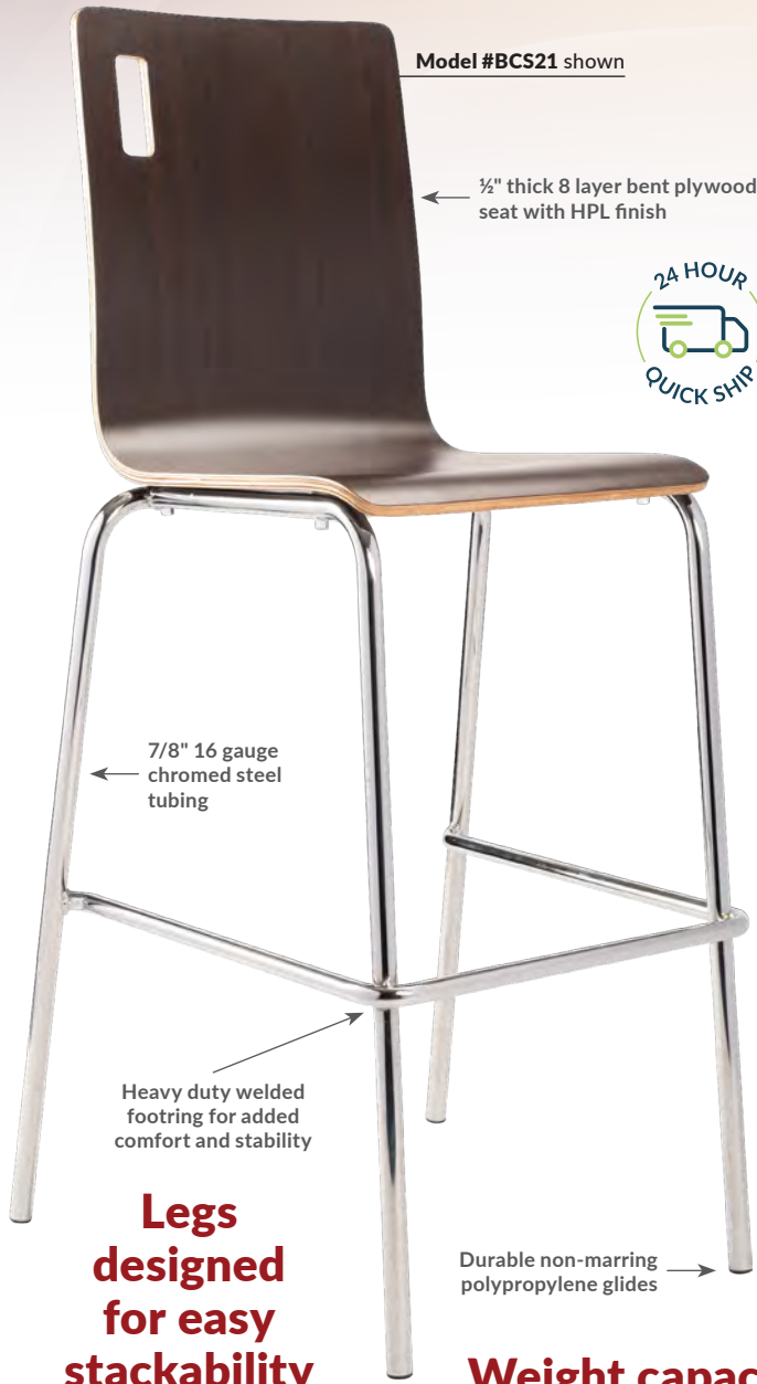
Model #BCS21 shown

½" thick 8 layer bent plywood seat with HPL finish