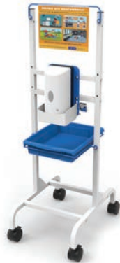
Base Model (SAN101)