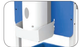
Child lock out feature for safety in place, dispenser is inaccessible