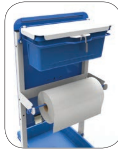
Back view (SAN100)