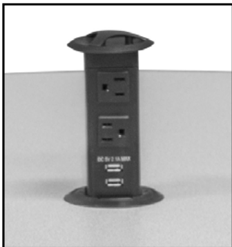
Table with Power Data Supply Order Model LF2666P