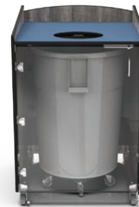
Waste container and dolly included