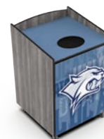
Option #3 • Laminate 1 - three sides • Laminate 2 - top • Logo laminate or a third laminate color on the front.