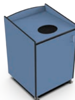
Option #1 • One laminate all sides/top