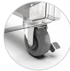
Poly II locking caster wheels

POLY II LOCKING CASTER WHEELS provide excellent floor protection, abrasion resistance, high impact strength, and easy, quiet operation. They are non-marking and resistant to water, oil and most chemicals. Cabinets and liners move with little effort on these long-lasting casters. Front cabinet casters lock for secure placement.