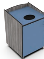
Option #2 • Laminate 1 - three sides • Laminate 2 - front/top