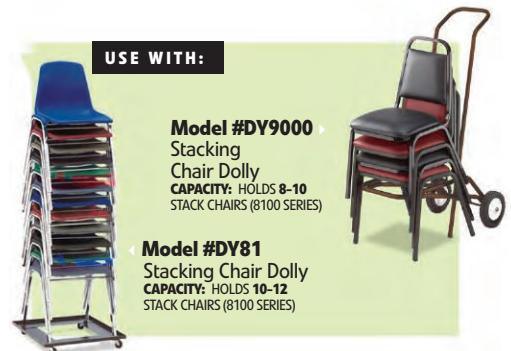
Model #DY9000 Stacking Chair Dolly CAPACITY: HOLDS 8-10 STACK CHAIRS (8100 SERIES)