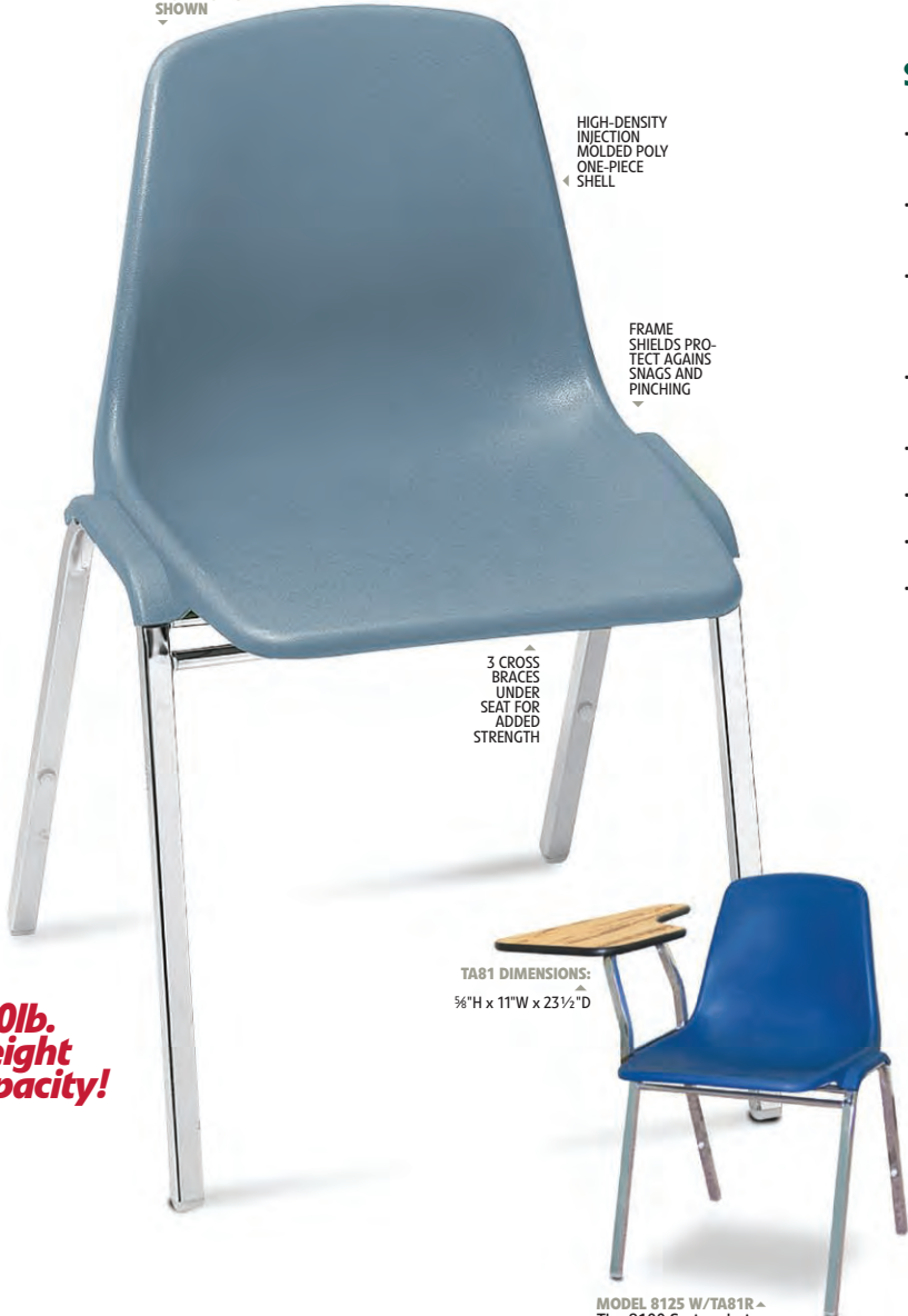
MODEL 8115 SHOWN

HIGH-DENSITY INJECTION MOLDED POLY ONE-PIECE SHELL