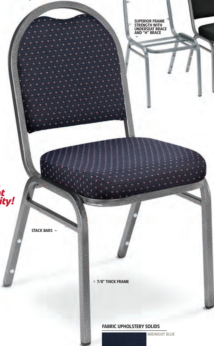
MODEL 9264-SV SHOWN

SUPERIOR FRAME STRENGTH WITH UNDERSEAT BRACE AND "H" BRACE