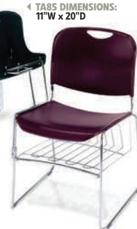
MODEL 8508 W/TAB5R AND BR85 The 8500 Series chair with the optional R/L Tablet and Book Rack