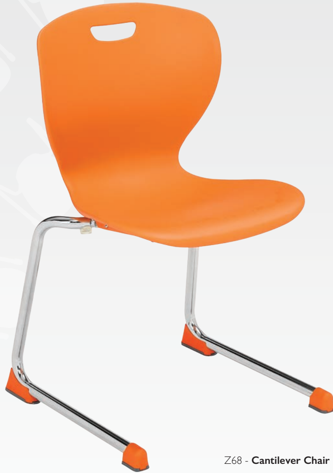
Z68 - Cantilever Chair