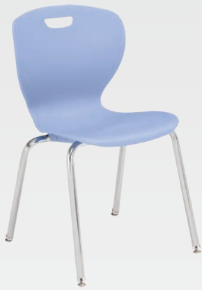
Z28 - Value Chair