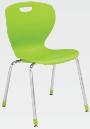
Z18 - Standard Chair