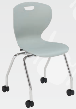
Z28C - Value with Casters