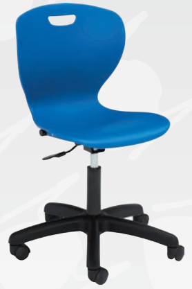
Z58 - Computer Chair