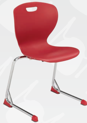
Z68X - X-Plus Cantilever Chair