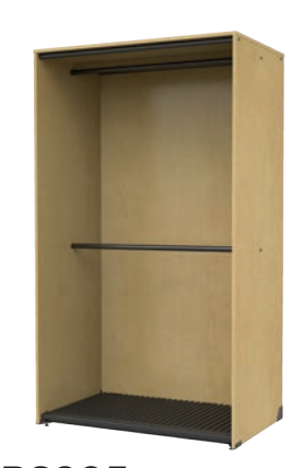
BS205 Cabinet: 48 x 84 x 29.25 Compartment: 46.5 x 78.75 x 27.125 Holds 40 Uniforms. Includes 2 Hanging Rods.

Holds 22 Uniforms. Includes 2 Hanging Rods.