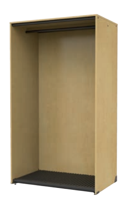
BS201 Cabinet: 48 x 84 x 29.25 Compartment: 46.25 x 78.75 x 27.125 Holds 20 Uniforms / Robes. Includes Hanging Rod.

Holds 11 Uniforms / Robes. Includes Hanging Rod.