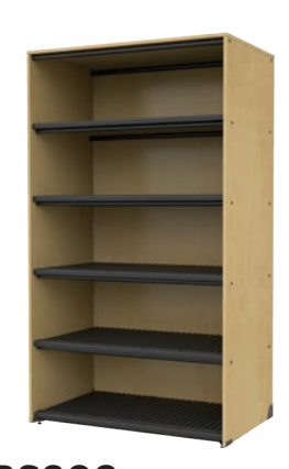
BS209 Cabinet: 48 x 84 x 29.25 Compartment: 46.5 x 13.75 x 27.125 Holds 45 Hats.