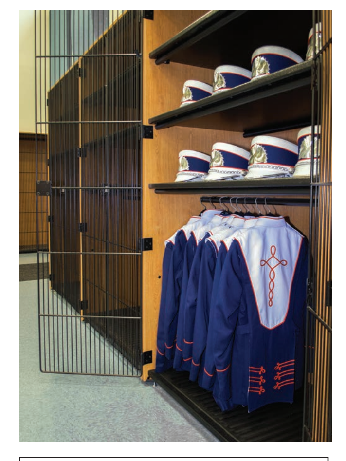
NOTE: Doors must be included at the time of ordering as they can not be installed later.