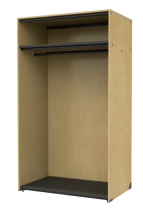
BS203 Cabinet: 48 x 84 x 29.25 Compartment: 46.5 x 78.75 x 27.125 Holds 20 Uniforms / Robes. Includes Shelf and Hanging Rod.