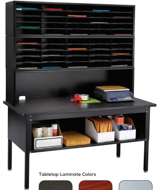
Tabletop Laminate Colors