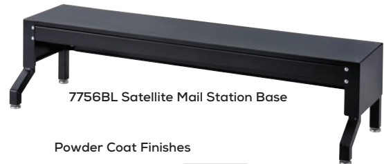
7756BL Satellite Mail Station Base