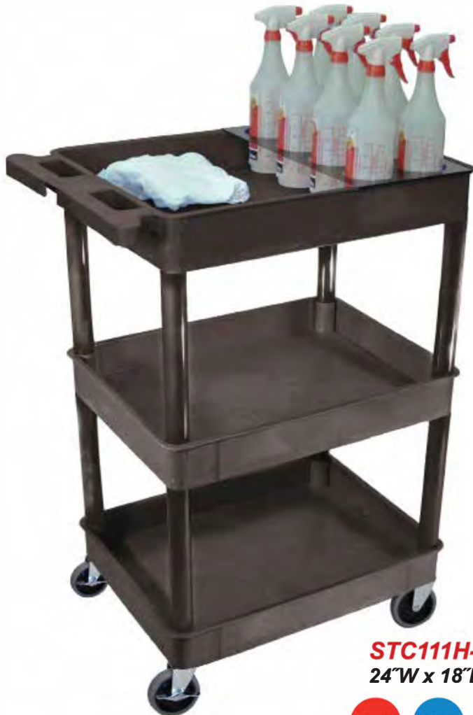
STC111H-B 24"W x 18"D x 36½"H