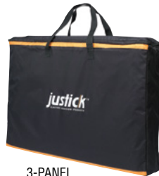
3-PANEL CARRY BAG