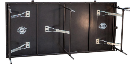
Simple "folding table like" design