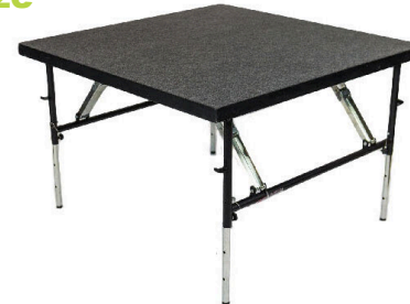
Available in compact 4' x 4' Size