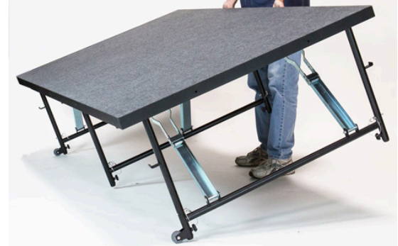
Available with built in wheels on one side for easy maneuverability!

Learn more and watch demo videos online at www.s101.intellistage.com