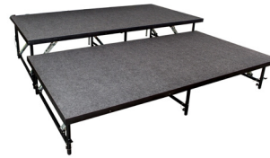
Each Stage can adjust to 2 heights