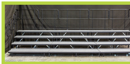
Choral Risers w/ wheels fold up flat for easy-set up and compact storage!