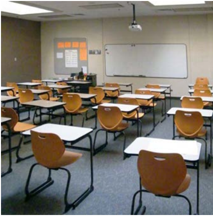
Classroom with Intellect Wave® chair/ desks and Instruct® teachers desk.