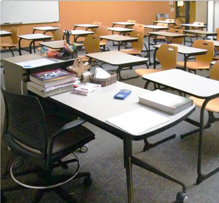
Classroom with Strive® task stool, Instruct® desk, and Intellect Wave® chairs and desks.

Challenge: Designed in the 1970's open-concept style, this school needed to be totally re-envisioned and renovated into a vibrant learning environment. New spaces must enable today's teaching approaches and technology. Flexibility is critical to support both traditional and collaborative teaching styles.