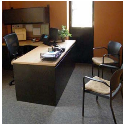
Office with Impress® Ultra task chair, 700 Series® desk and Rapture® stack chairs.