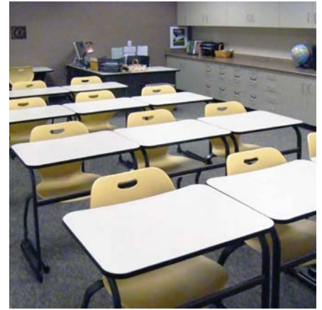
Classroom with Intellect Wave® chair/ desks and Instruct® teachers desk.