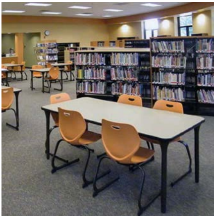
Library with Intellect Wave® chairs, Inquire® tables and Spacesaver® shelving.

Solution: KI was selected to furnish classrooms, computer labs, the entire library, offices, and meeting/breakroom spaces. This solution ensures a coordinated look and feel throughout the school. Color choices provide variety and visual excitement. Classrooms feature flexible, durable Intellect Wave® furniture and include ADA accessible desks. Also integral to the new classrooms are Instruct® All Terrain mobile instructor's desks, which can be moved within the room and accommodate both seated or standing teaching styles.