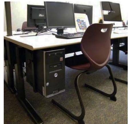
Computer room with InTandem® table system and Intellect Wave® chairs.