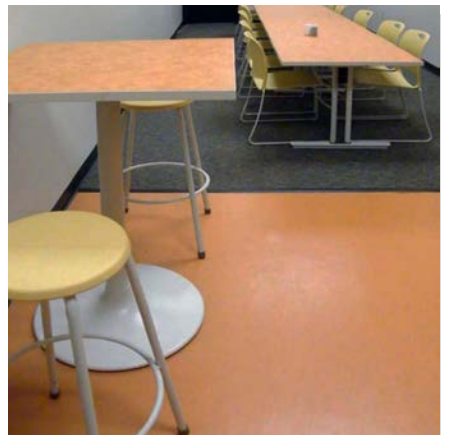
Conference room with 600 Series™ stools, Athens® table, Synthesis® table, and Maestro® stack chairs.