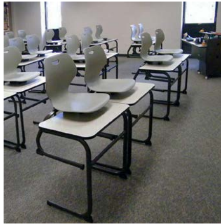
Classroom with Intellect Wave® chair/ desks and Instruct® teachers desk.