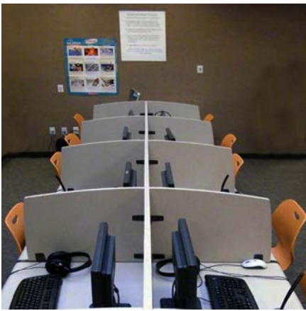
Computer room with InTandem® table system with dividers and Intellect Wave® chairs.