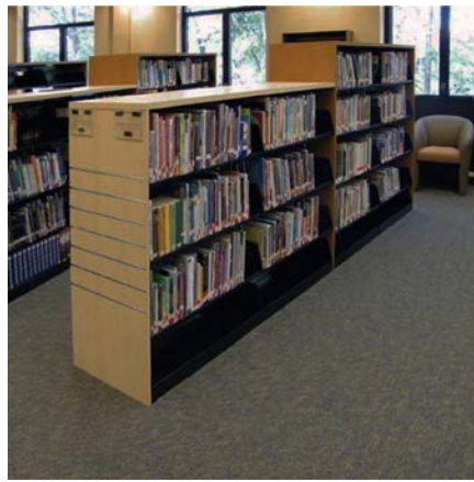
Library with Spacesaver shelving and Ivey™ lounge chair