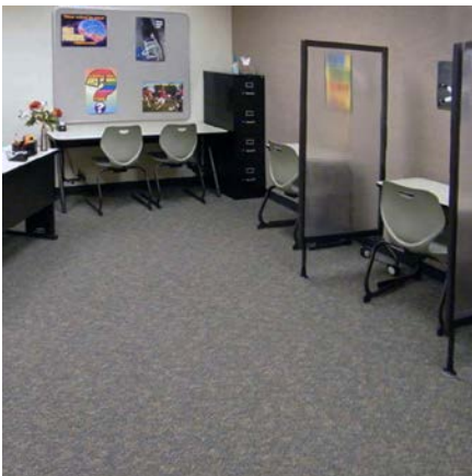
Office with Intellect Wave® chairs/desks and All Terrain® screen.