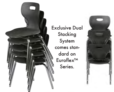
Exclusive Dual Stacking System comes standard on Euroflex™ Series.

Choose the glide base you need for your floor surface. When glide needs replacement, snap-lock on a new base. Nylon, Steel, Neoprene, Wool Felt