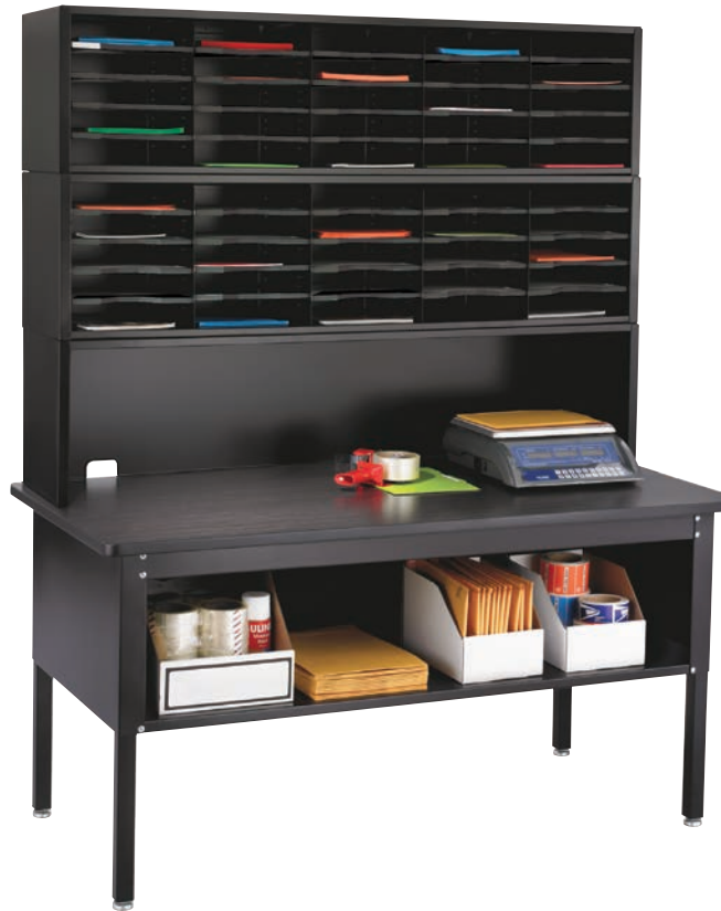
Table Top Colors