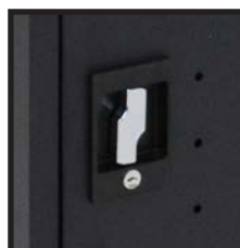
Heavy-Duty locking system.