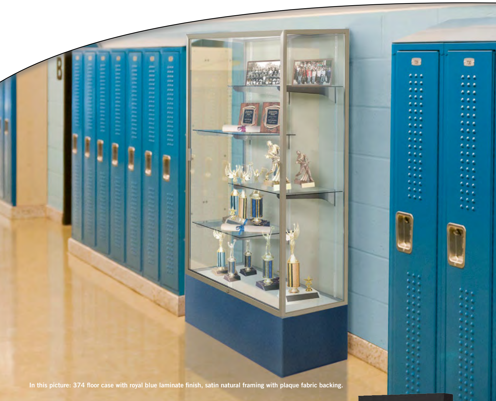
In this picture: 374 floor case with royal blue laminate finish, satin natural framing with plaque fabric backing.