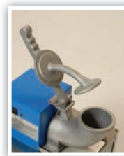
Cast Aluminum Assembly