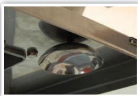
Convenient Snow Cone Shaper