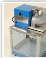
Polycarbonate Service Door