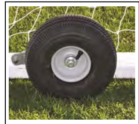
OPTIONAL WHEEL KIT