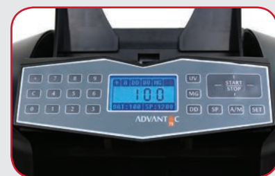
Easy to read display