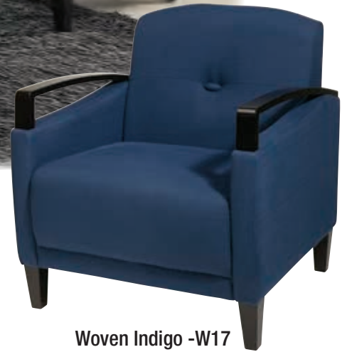
Woven Indigo -W17