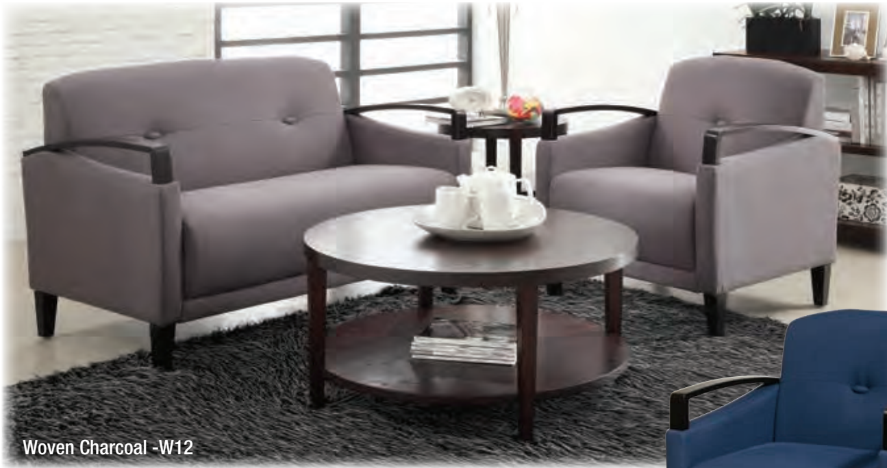
Woven Charcoal -W12