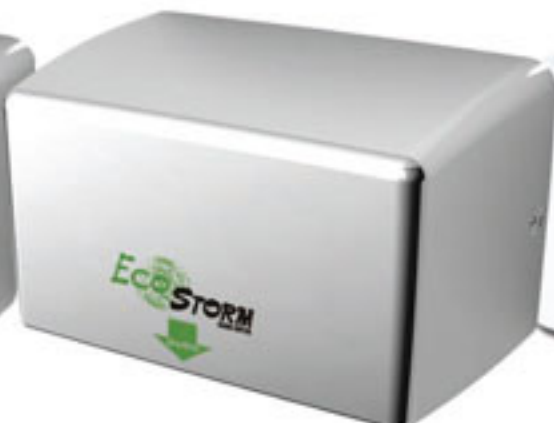
HD0940-10 Bright Stainless