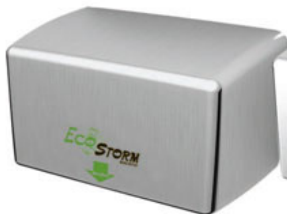
HD0940-09 Brushed Stainless

THE ECOSTORM HUSH IS ONE OF THE QUIETEST HIGH SPEED HAND DRYERS IN THE INDUSTRY!