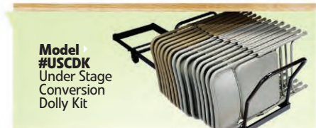
Model #USCDK Under Stage Conversion Dolly Kit

INSIDE WIDTH: 19" W WITH A 2" LIP TO ACCOMMODATE CHAIRS 15 1/4" W – 19" W