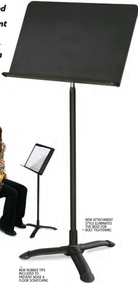
NEW ATTACHMENT STYLE ELIMINATES THE NEED FOR BOLT TIGHTENING