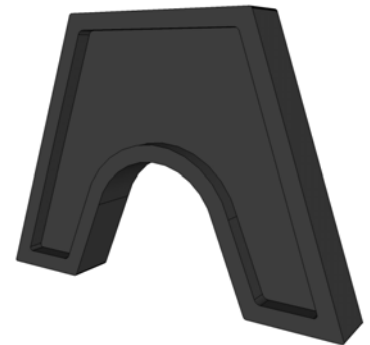
Base Component - (3)