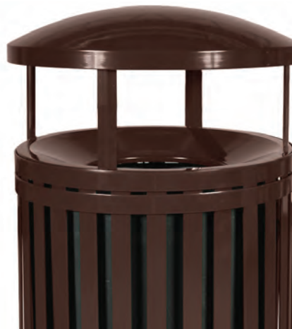
SCTP-40 D ND