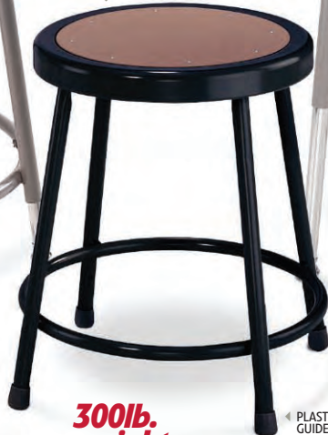
MODEL 6218 SHOWN