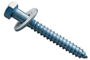
(1) HARDWARE; LAG SCREWS & WASHERS