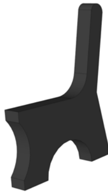
(3) PRE-DRILLED BENCH SUPPORTS